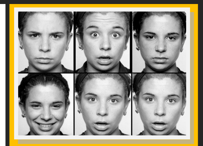
Ad Probe also offers Vision One's i-Test — facial

Call or <u>email</u> us today for more information about Vision One or any other research requirements you may wish to discuss or visit our website.